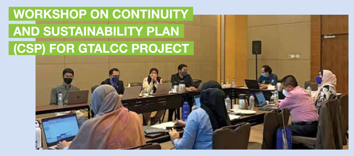
Discussion session at the workshop on CSP for GTALCC Project

On February 20-22, 2022, MGTC hosted a retreat session involving AEMAS EMGS assessors and stakeholders. The main objective of this programme was to discuss, develop and fine-tune the EMGS Standards that will be used for AEMAS EMGS assessments and reference for the Energy Manager Training Course (EMTC) module. The participants also discussed success stories, challenges, strategies, and the way forward for EMGS certification.