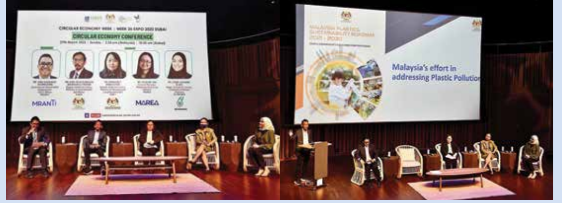
The opening event included the Circular Economy Conference, a panel sharing session by experts from KASA, The Ministry of Housing and Local Government, Malaysian Recycling Alliance (MAREA) and national oil and gas company PETRONAS, sharing the latest development