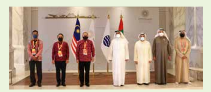
The Honourable Datuk Haji Ahmad Amzad Hashim, Deputy Minister of Science, Technology and Innovation Malaysia (third from left), H.E Ahmed bin Ali Al Sayegh, Minister of State, UAE Cabinet (centre) and their delegations posing for photos at the Leadership Pavilion before the ceremony began

The highlight of January 2022 was the Malaysia Day celebration in Expo 2020 Dubai where Malaysia Pavilion paid tribute to the country's achievements in key sectors such as economy, social, culture, science and technology, in conjunction with the day of honour given by Expo 2020 Dubai to participating countries.