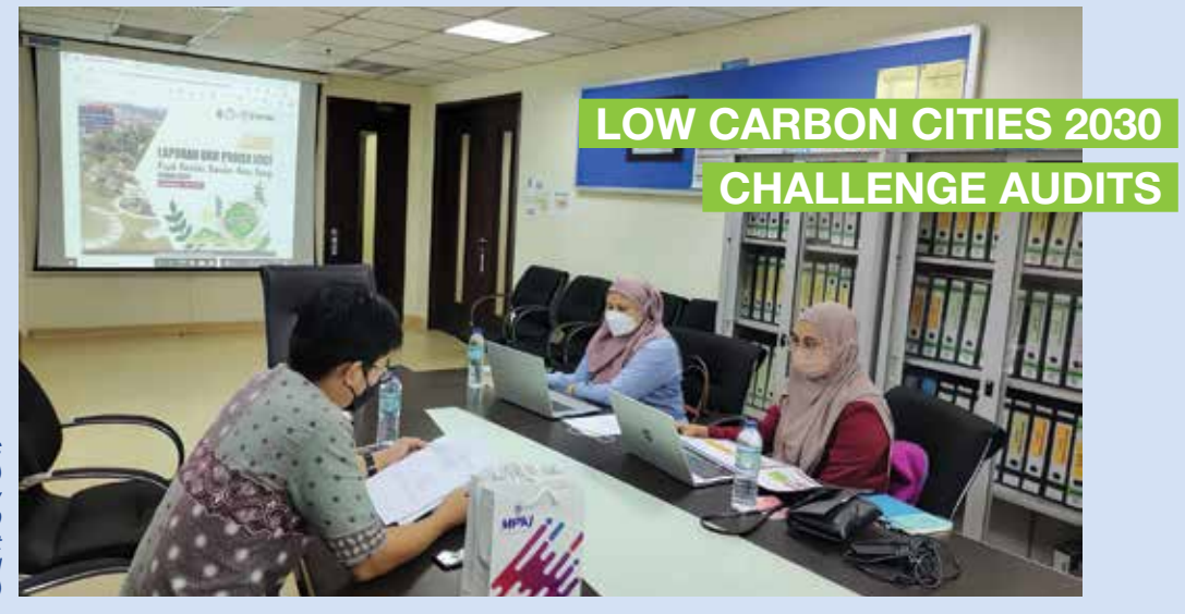
Auditors from MGTC (right hand side) conducting a Low Carbon Cities 2030 Challenge audit at Kajang Municipal Council (MPKJ)

of ministries, departments, agencies, small & medium industries and academia that have been managed by technical experts based on expertise specifications, so that the green practices and training modules developed are able to add value to the existing legal framework and training modules.