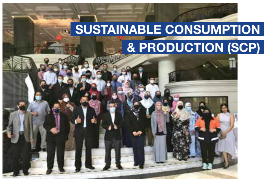
Development of Green Industry was successfully organised by secretariat GSVC Sustainable Consumption & Production (SCP)

Two workshops were organised by the SCP team of which were the 'Development on Module Training Green Practices' and 'Development on Green Practices Guidelines' programmes. These workshops were held at Marriott and Everly Hotel, Putrajaya to obtain input and comments on the development of training modules and green practices from relevant stakeholders consisting