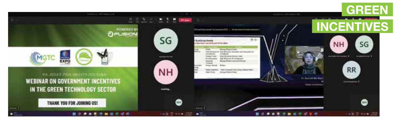
The webinar session held on 23<sup>rd</sup> March 2022

The virtual webinar sessions on Government Incentives in the Green Technology Sector were held on March 23, 2022 through Malaysia Dubai EXPO 2020 ePavilion platform. The main objective of these webinars is to promote the government initiatives and related incentives that are available on green technology sector to the local companies and entrepreneurs that are based in Malaysia.