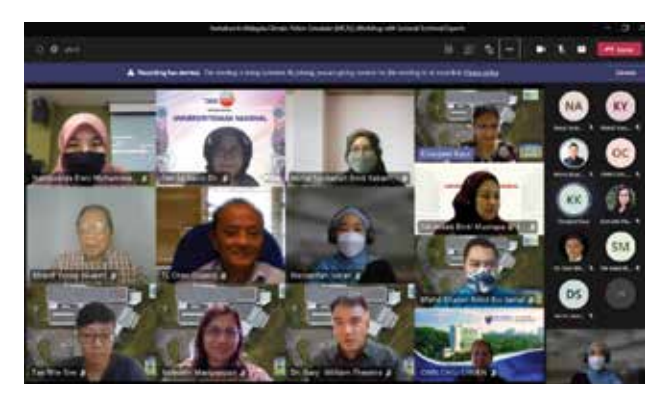
10Group Photo of MCAS Technical Team and Sectoral Experts

Malaysia Climate Action Simulator (MCAS) is a simulation tool, which allows the user to simulate a series of possible low carbon future scenarios through 2050 to visualise the national carbon emissions trajectory over time. Using MCAS, you can create plausible pathways to find out how Malaysia can reduce greenhouse gas emissions up to 2050. It allows the user to choose different mitigation options (changes in technologies, fuels, land use, and lifestyles) and get insights into possible outcomes based on the choices. MCAS acts as an awareness tool that is open and easy to understand which aims to bring together policymakers, industry leaders, experts, and civil societies into climate change conversation and engagement in exploring various pathways for Malaysia to be developed into a low-carbon nation.