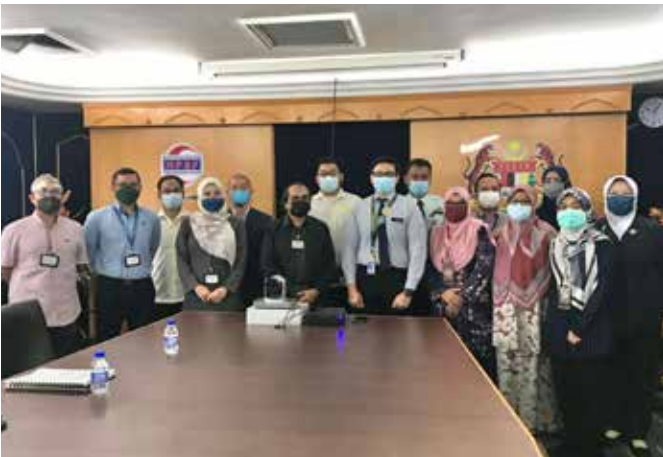
Hospital Pakar Sultanah Fatimah, Muar, 20 – 22 June 2022