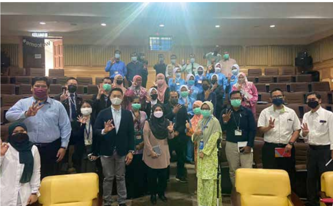
Institut Perubatan Respiratori, 14 – 16 June 2022

In June 2022, MGTC conducted 3 EMGS Assessments. The organisations involved are Hospital Rompin, Pahang, Institut Perubatan Respiratori, Kuala Lumpur and Hospital Pakar Sultanah Fatimah, Muar, Johor. The assessments took place for three days and were conducted by teams of AEMAS-certified assessors. The EMGS Assessment for Hospital Rompin is for the 2-Star level, which focuses on achieving a minimum of 5% energy reduction compared to the baseline. At the same time, the other two organisations had undergone the 3-Star EMGS Assessment, which focusses on continuously improving and sustaining the energy reduction while integrating energy efficiency as one of their organisation’s cultures. All the organisations have shown a clear adaptation and approach for their energy management system during the assessments.