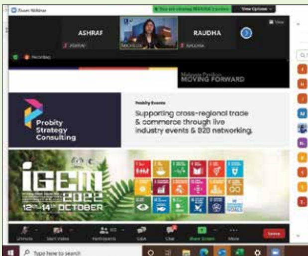
A webinar was held on 19 July 2022 to update companies on the opportunities still available through the virtual platform.

A two-day business matching session facilitated by Probity will be held on 6 and 7 September 2022 followed by a sharing session the next day.