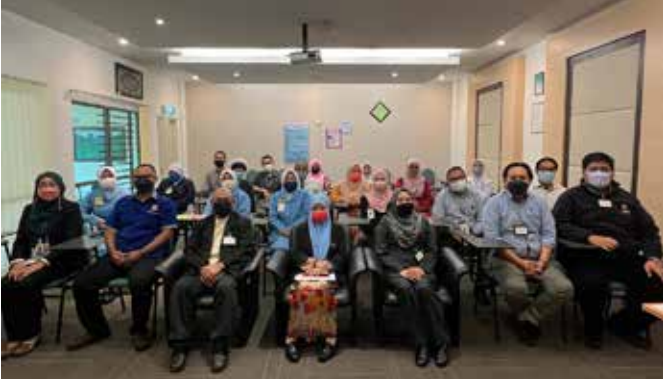
Hospital Rompin, 30 May – 1 June 2022