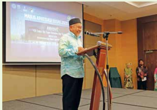
KASA Minister YB Dato' Sri Tuan Ibrahim Tuan Man gave a speech at the dinner to commemorate the achievements of the MGTC team